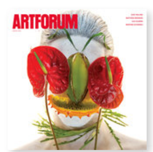
PRINT JANUARY 2019

All Cities Berkeley Berlin Bilbao Brussels Chicago Hamburg Leipzig London Los Angeles Mexico City Milan Mumbai New York Palermo Paris Philadelphia Portland Rio de Janeiro San Francisco São Paulo