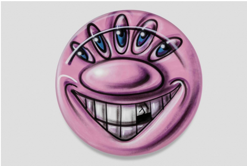
Kenny Scharf "HAVE A NICE DAY!" Spray paint on Canvas 40 inches; 101.6 diameter

Each year La Nave Salinas presents an exhibition dedicated to the most influential artists of our times. The building is a massive stone structure at the edge of the sea of 700 square meters and 15 meters high, built in 1941 to store the salt harvested in the ponds integrated into the Natural Park of Ses Salines. On 2019, for its fifth anniversary, Kenny Scharf will present his first solo exhibition in Spain for more than two decades.