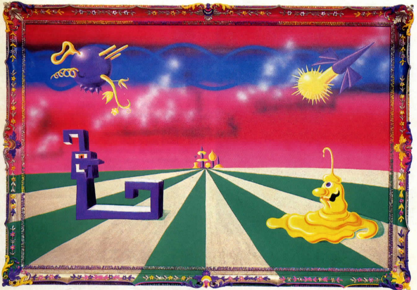
TOP When Worlds Collide , 1984, 10 feet 2 inches by 17 feet 5 inches. ABOVE Forever Now , 1984, 4 feet 7/4 inches by 6 feet 7 inches: surrealism without the terror or dread.