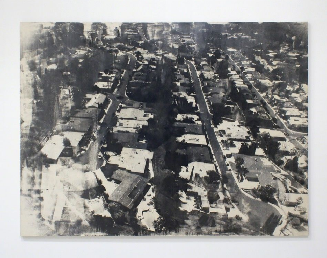
Hollywood Hills 1 (15 minutes from fame series), 2015 Edward Cella Art and Architecture

The other works in the show serve to underscore the variety in the program, which is a sophisticated group of artists that represent a strange middle ground in painting today. The show as a whole, feels monumental and disorienting, the artists using every inch of their canvases to create abstractions, representational works, and something in between.