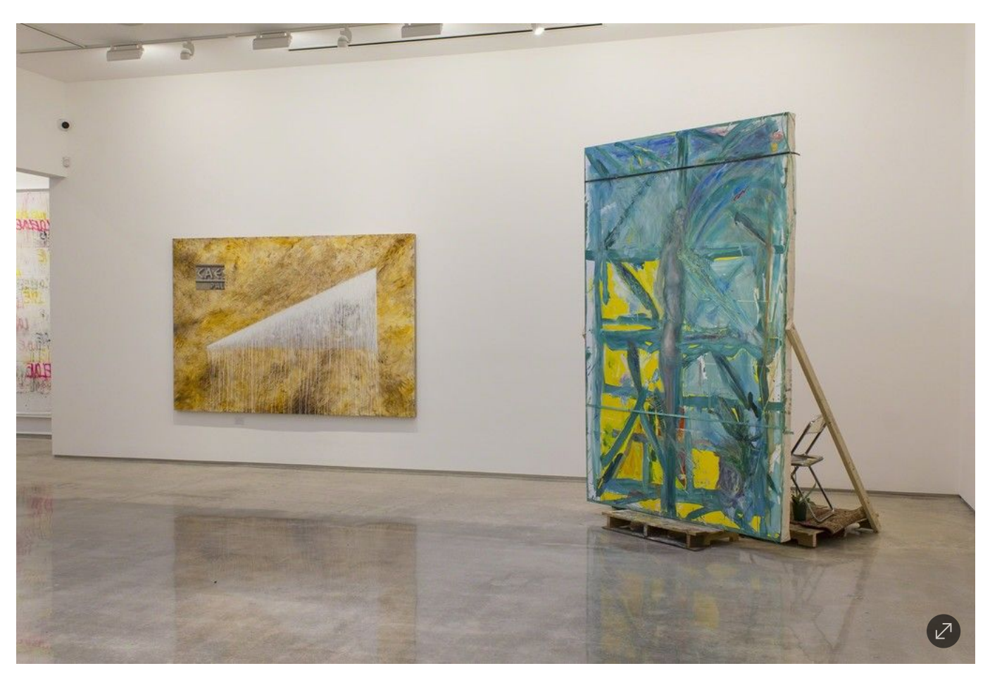
Installation view of "Unbound," Edward Cella Art and Architecture, Los Angeles.