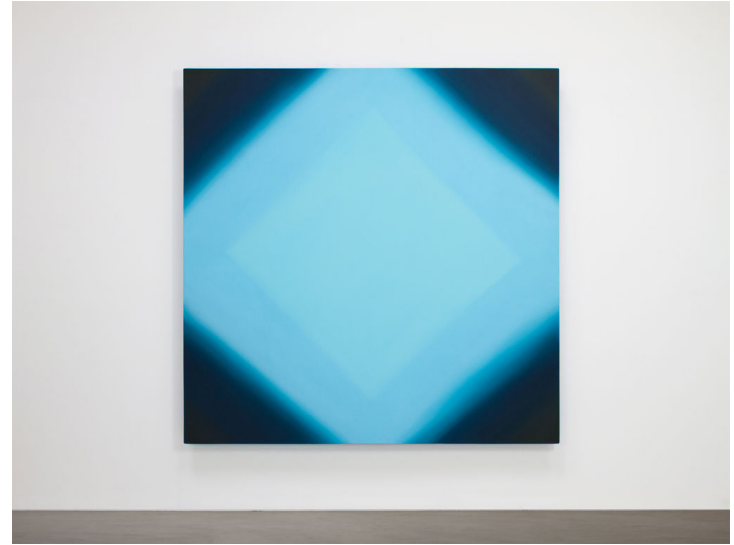
Blue Orange 4-S7272 Diamond, 2015 Edward Cella Art and Architecture

Perhaps the one thing that unites the paintings in "Unbound" is their size. The show features new large-scale works by eight artists. Highlights include Mara De Luca's Ramona 3 (2015), which shows an abstract landscape-like image that resembles a fiery L.A. sunset; Ruth Pastine's Blue Orange 4-S7272 Diamond (2015), a beautiful optical color study in glowing blue; and Spencer Lewis's Une étude de femme d'après nature (After Villers) (2015), a massive canvas propped up by a structure that on the verso reveals a scene straight from an artist's studio, complete with an art magazine on a paint spattered chair.