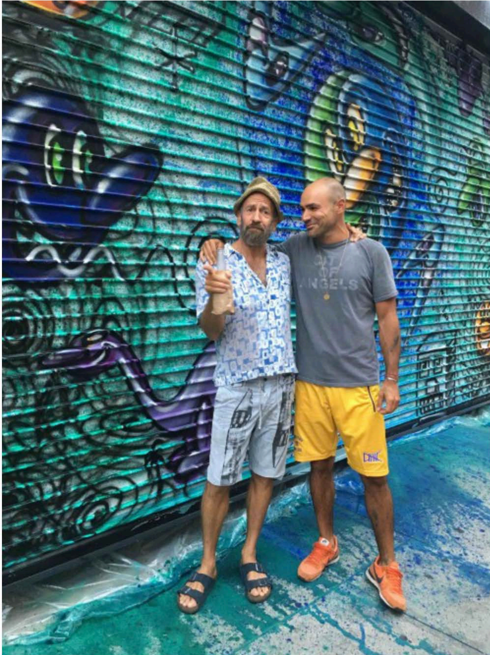
TOTAH Gallery has a new mural from artist Kenny Scharf on their storefront gate at 183 Stanton Street.