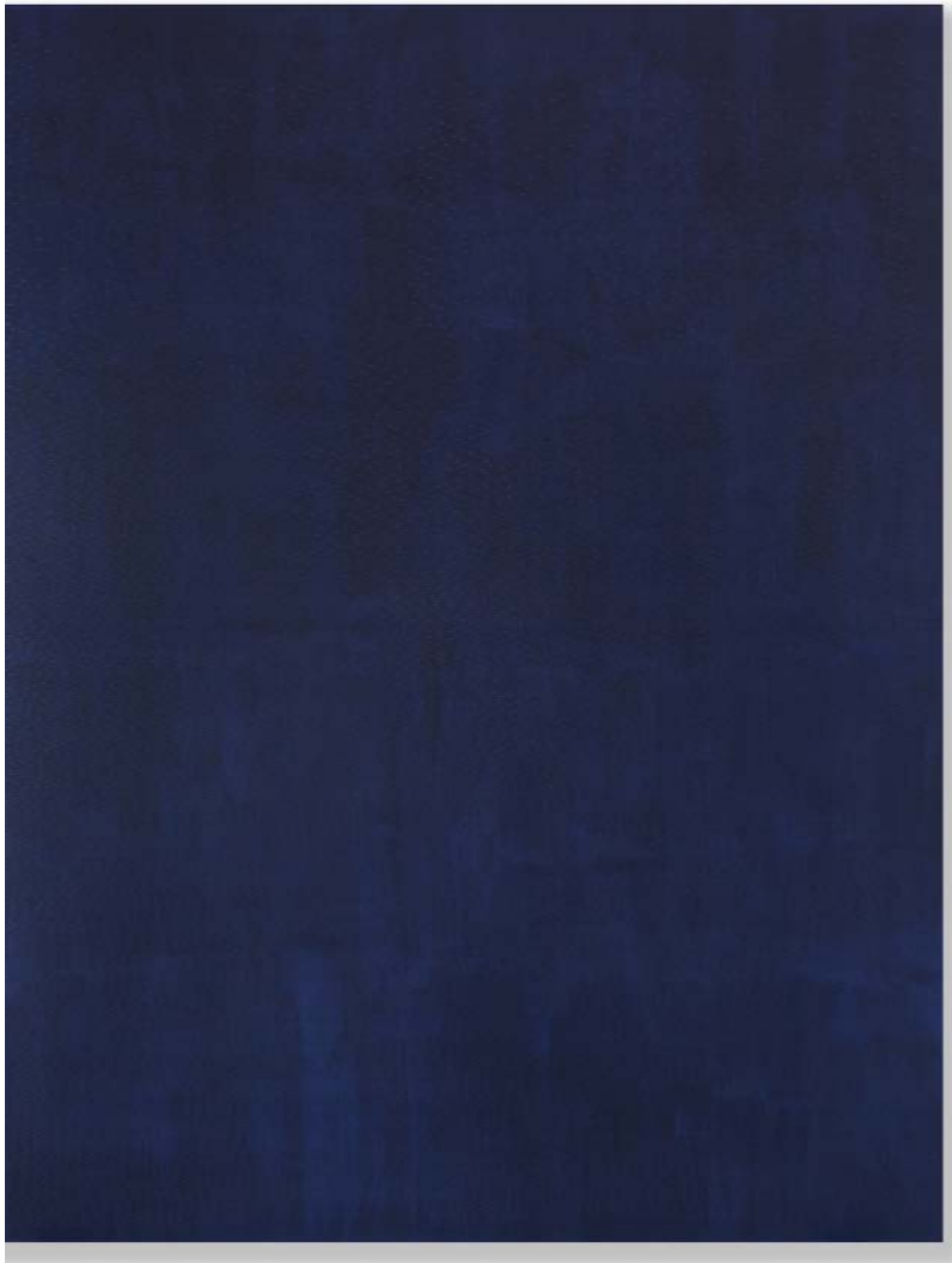
Alison Hall, "Maiden" (2017), oil, graphite and plaster on panel, 91 x 71 inches

In the black paintings, each bearing the name of a person, including one titled "Bridget (Bardot)" (2017), Hall might fill in some of the hexagons created by the pattern of dots with dark red oxide, or draw lines connecting the dots to make a schematic rectangle. The addition of another color brings light to the black ground, but it is hushed and elusive, less than flicker. In the blue paintings, Hall pares the light down to the reflection in the graphite dots, a faint dark glint.