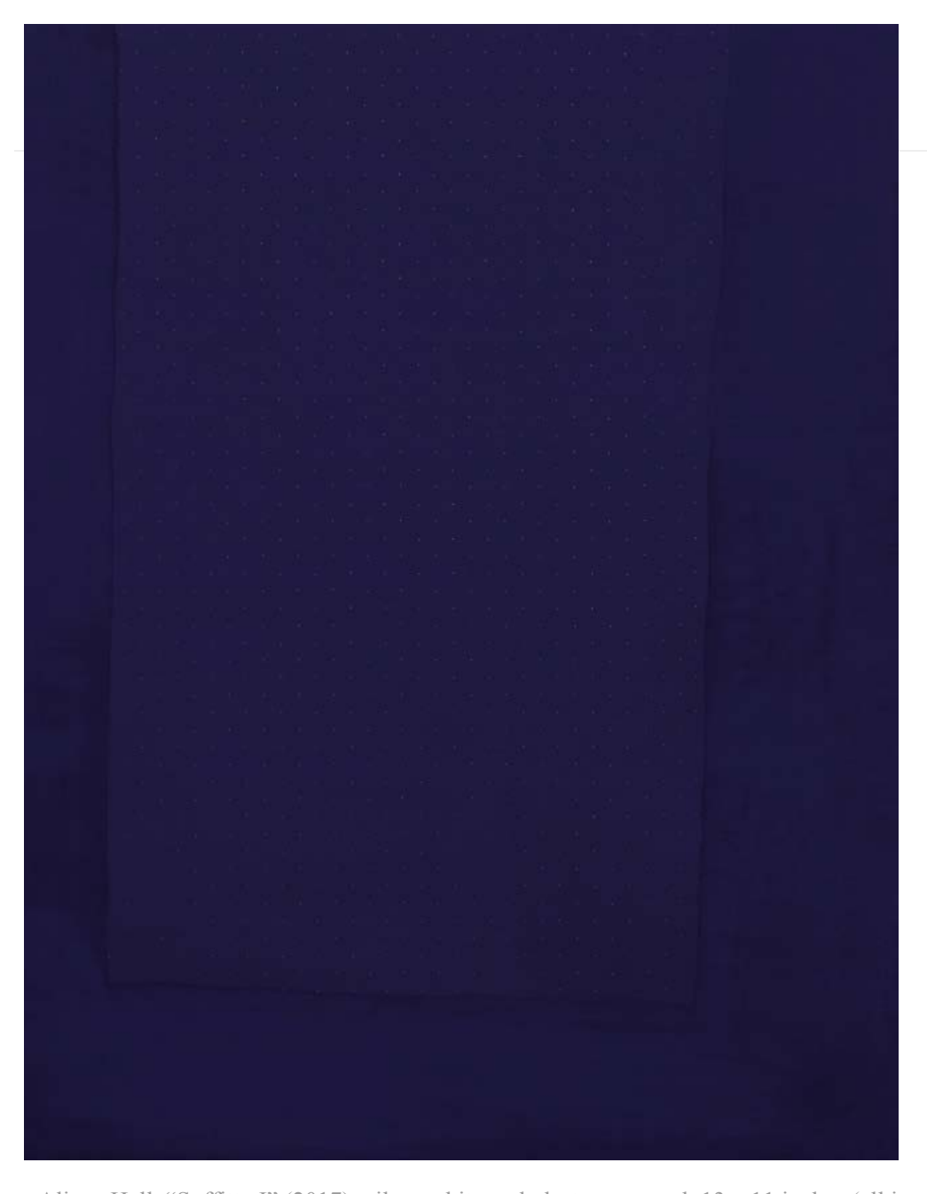
Alison Hall, "Soffitto I" (2017), oil, graphite and plaster on panel, 13 x 11 inches