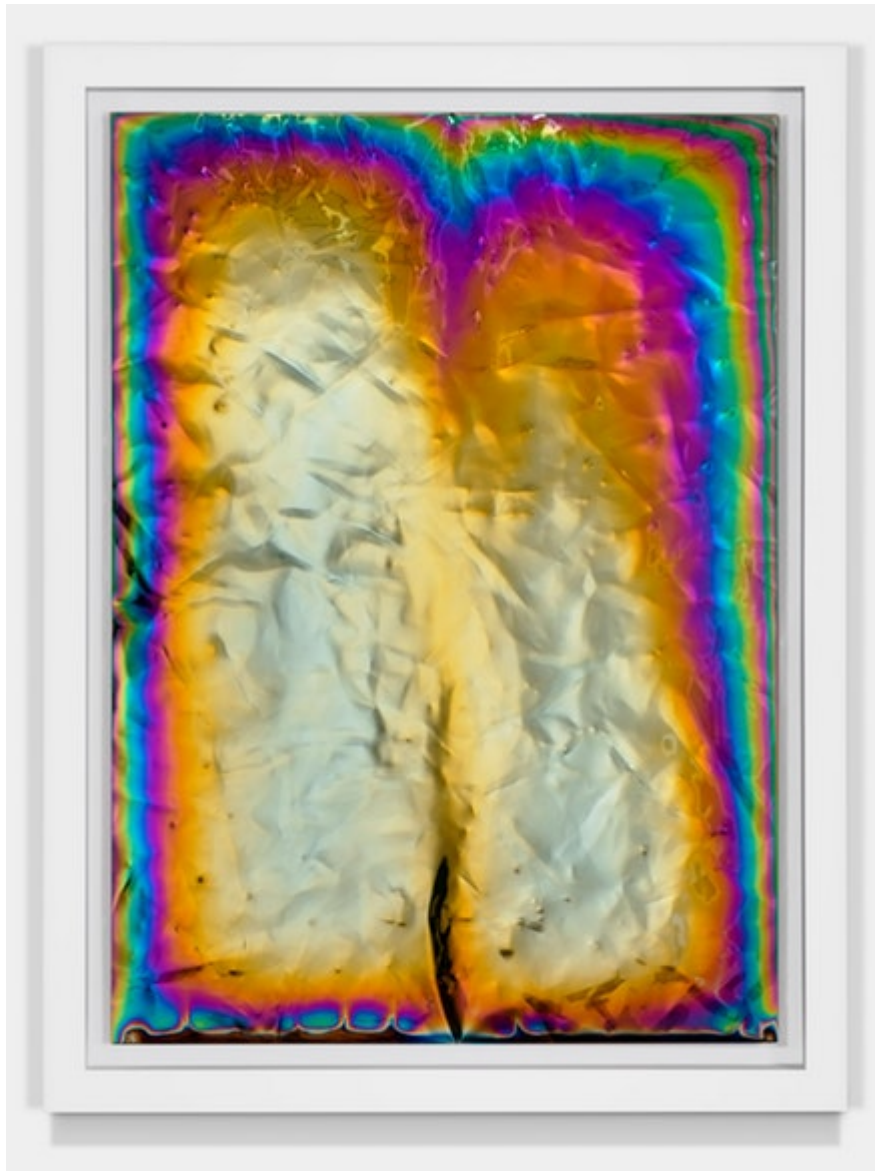
Aleksandar Duravcevic, YOUTH , 2019. Chemically treated stainless steel, 27 1/2 x 19 1/2 inches. Courtesy the artist and TOTAH.

Viewers cannot see this process. What they can see, amid the strange rainbows on the surface of the stainless steel, is themselves. Most of the works in YOUTH have a reflective quality that transforms visitors into potential avatars of Narcissus. This interaction between viewer and artwork takes place most spectacularly in YOUTH (2019), a landscape-format work measuring 16 inches by 30. The piece divides into two distinct halves: we realize that we are looking into a kind of book, opened before us. And what we see, as we do whenever we read, is the author's text: here Duravcevic's mesmerizing colors, but also our own reflected image. All texts, all works of art, are ultimately mirrors because the moment we try to understand them, we impose our individual experience and knowledge. Duravcevic demonstrates this in other works where he partially corrugates the stainless steel sheet. This rippling of the surface resembles water on a pond and takes us back to Narcissus staring at himself in the pool of water. As in dreams, everything here returns to the viewer's gaze.