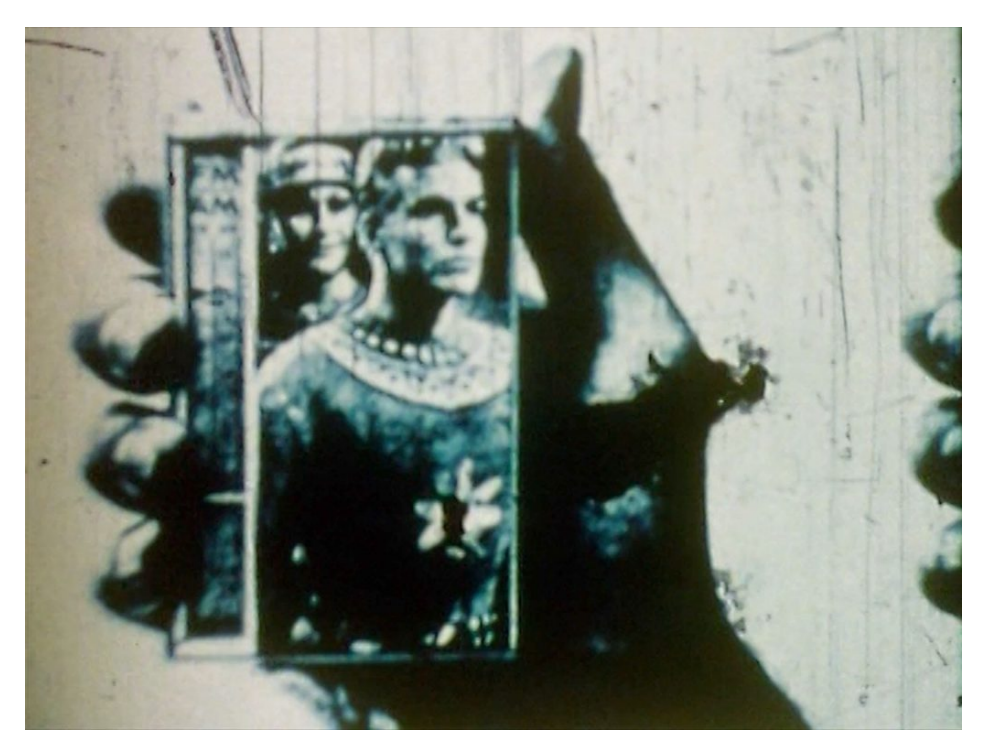
Film Still from Wallace Berman's Aleph (1956–66). 16mm film transferred to video (black and white, silent)