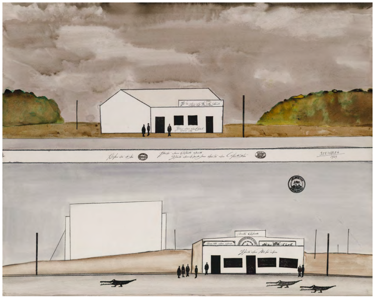
SAUL STEINBERG'S MOMBASA (1969).